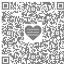
Implantable cardioverter defibrillator (ICD)