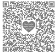
Ventricular septal defect