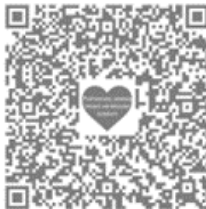
Pulmonary atresia with intact ventricular septum