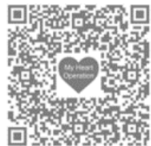
My heart operation