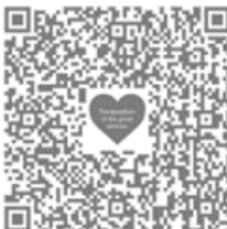
Transposition of the great arteries