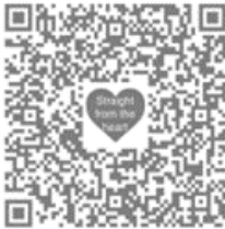
"Straight from the heart"

Scan the QR codes using your smartphone camera or QR reader to view the booklets.