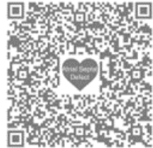
Atrial Septal Defect