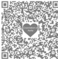
Coarctation of the Aorta