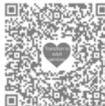
Transition to adult services