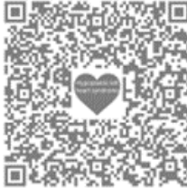
Hypoplastic left heart syndrome