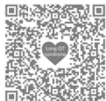
Long QT syndrome