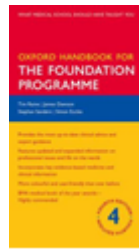
Oxford Handbook for the Foundation Programme