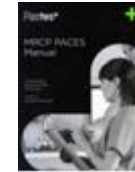
MRCP PACES Manual