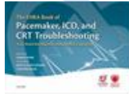
The EHRA Book of Pacemaker, ICD and CRT Troubleshooting