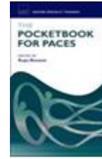
The Pocketbook for PACES