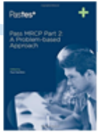
MRCP Part 2 : a Problem-based Approach