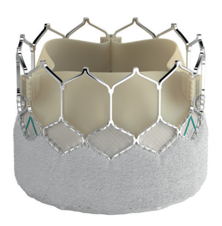
Edwards SAPIEN 3TM transcatheter heart valve

Transcatheter aortic valve implantation (TAVI) involves inserting a prosthetic heart valve inside your narrowed or leaky valve using a catheter. The valve is made up of a metal frame (stent) and the outer lining (pericardium) of a cow's or pig's heart. The procedure is usually carried out under consious sedation with local anaesthetic. General anaesthetic is used in cases where transfemoral access is not possible (surgical approaches). There are two types of valve we use: balloon expanded and self-expandable.