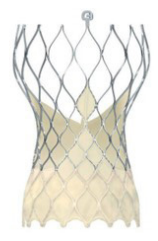
Medtronic Evolut PRO valve

The TAVI team, including your cardiologist, cardiac surgeon and anaesthetist, will review your medical condition and screening tests to decide the most appropriate treatment and access route for you.