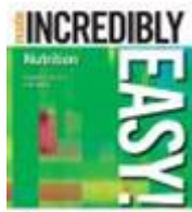
Nutrition made incredibly easy!