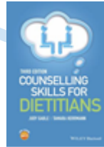
Counselling Skills for Dietitians