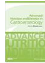
Advanced Nutrition and Dietetics in Gastroenterology