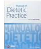
Manual of Dietetic Practice