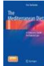
The Mediterranean Diet: a Clinician's Guide for Patient Care