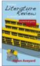
Doing a Literature Review