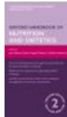
Oxford handbook of nutrition and dietetics